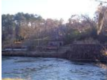
Augusta Canal Upper Locks