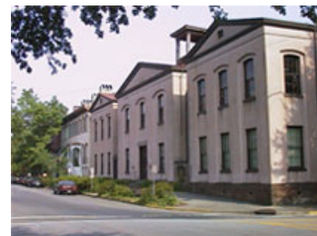
Massie Heritage Center, Savannah

June 27 - Architectural history of Savannah - depart to Charleston