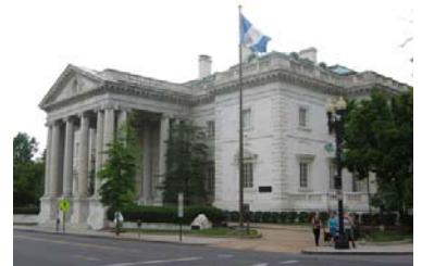
DAR HQ, Conn. Ave